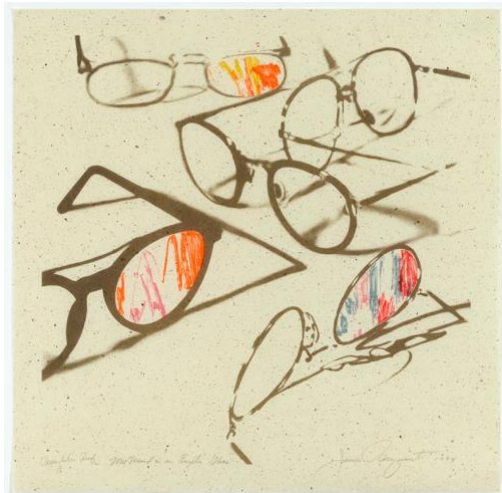
James Rosenquist, My Mind is an Empty Glass , 1994 4-run, 6-color photo-lithograph; 34 x 34 inches. Edition: 42

TAMPA, FL – April 2025 – Art enthusiasts and collectors, mark your calendars for Saturday, May 10 , as Graphicstudio, a world-renowned research atelier at the University of South Florida, hosts its highly anticipated Annual Open House and Benefit Sale . For one day only, from 10:00am to 5:00pm, visitors will have the rare opportunity to purchase limited edition prints and sculpture multiples at discounted prices of 10 to 40% off the list price.