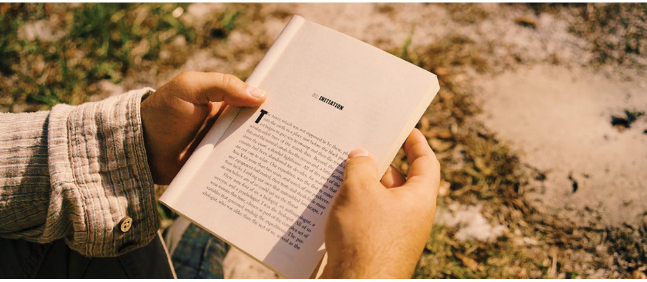
Luke Myers, Reading With Ants: Annihilation, 2019. Cover image: Andrés Ramírez, Polar Grass, from the August/September book of Put Your Glasses Back On (Face The Facts), 2019