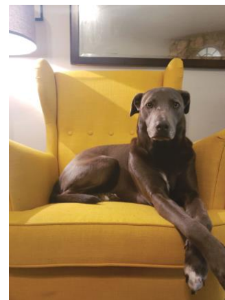
Evan Fountain, Throne Room , 2022. From 2022 Breaking Barriers Workshop.

Other Optional equipment: cellphone tripod or grip. Other lighting and photographic equipment are welcome but not required.