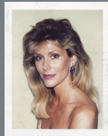
Andy Warhol, Unidentified Woman #23 (Blonde Hair and Dog), 1986. University of South Florida Collection, © The Andy Warhol Foundation for the Visual Arts, Inc. Facing page: Jason Lazarus, Spencer Elden in his last year of high school (January 2008) , 2008. Image courtesy of the artist; Collection of the Museum of Contemporary Photography at Columbia College Chicago.